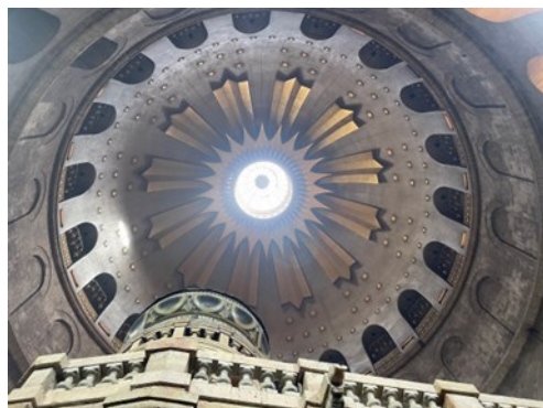
Church of The Holy Sepulchre, Jerusalem